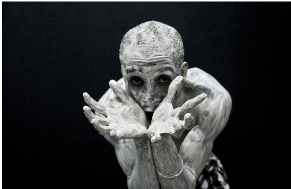
Jelili Atiku, Quest for Gaia Performance at Centre for Contemporary Art, Sabo, Yaba, Lagos, Nigeria

October 31, 2015, Performance in public space “Emi, Abi Emi Ko?” (Alaraagbo IX), Emi, Abi Emi Ko?” (Alaraagbo IX) refers to the potentiality of the human body, as it becomes symbolic of objects and metaphorical contents on the prevailing circumstance of ecosystems of the world.